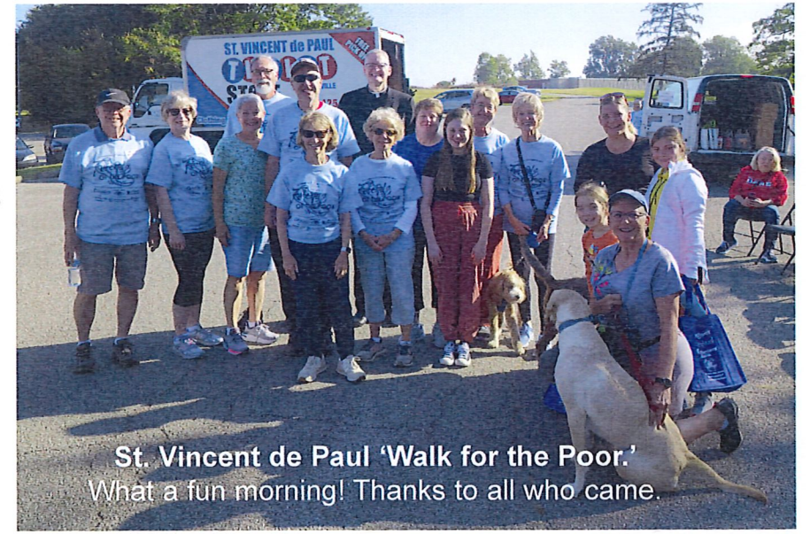
St. Vincent de Paul 'Walk for the Poor.' What a fun morning! Thanks to all who came.

WEEKEND MASSES Saturday Mass 4:00 pm | Confession 3:15-3:45 pm Sunday Mass 10:00 am | Confession 9:15-9:45 am Sunday Mass 4:00 pm | Confession 3:15-3:45 pm WEEKDAY MASSES Monday, Tuesday, Thursday, Friday Adoration 11:00 am | Confession 11:30-11:55 am | Mass 12:05 pm