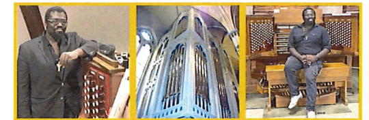
The Evansville Chapter of the American Guild of Organists presents an

Philippians 4:6 - Do not be anxious about anything, but in everything by prayer and supplication with thanksgiving let your requests be made known to God."