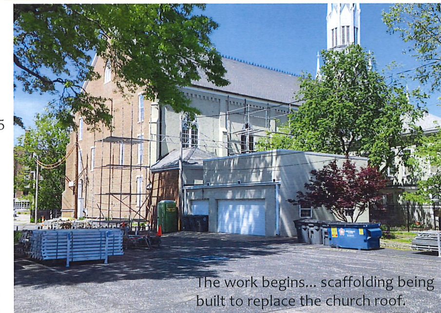
The work begins... scaffolding being built to replace the church roof.

WEEKEND MASSES Saturday Mass 4:00 pm | Confession 3:15-3:45 pm Sunday Mass 10:00 am | Confession 9:15-9:45 am Sunday Mass 4:00 pm | Confession 3:15-3:45 pm WEEKDAY MASSES Monday, Tuesday, Thursday, Friday Adoration 11:00 am | Confession 11:30-11:55 am | Mass 12:05 pm