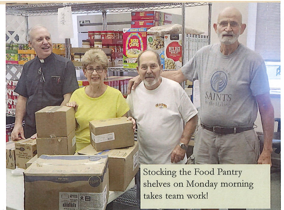
Stocking the Food Pantry shelves on Monday morning takes team work!

Items for the bulletin need to be turned in by 12:00 pm on Tuesdays Office Hours: Monday-Friday 8 am- 4 pm Food Pantry Hours: Mon, Tues, Wed, Thurs 9 am-Noon and 1-3 pm