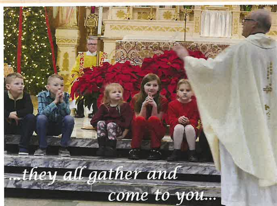
...they all gather and come to you...

WEEKEND MASSES Saturday Mass 4:00 pm | Confession 3:15-3:45 pm Sunday Mass 10:00 am | Confession 9:15-9:45 am Sunday Mass 4:00 pm | Confession 3:15-3:45 pm WEEKDAY MASSES Monday, Tuesday, Thursday, Friday Adoration 11:00 am | Confession 11:30-11:55 am | Mass 12:05 pm